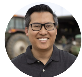
Congressman Vince Fong (CA-20)