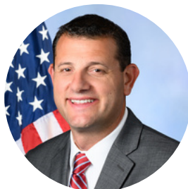
Congressman David Valadao (CA-22)