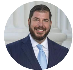
Asm. Joaquin Arambula (AD-31)